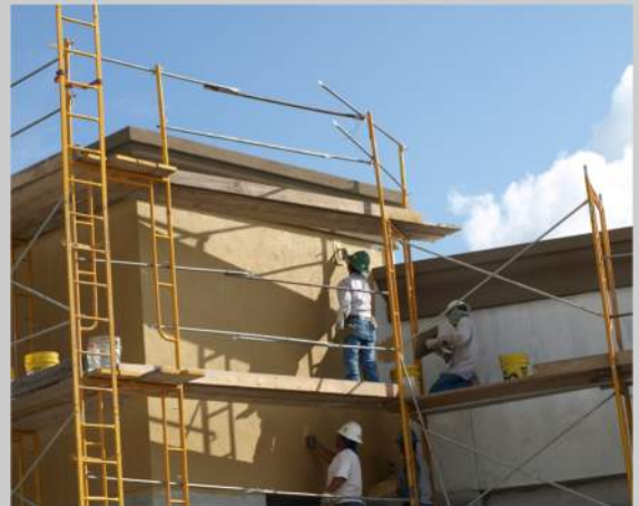
EIFS with Integral Color