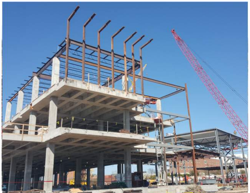
Texas A&M Commerce Nursing and Health Sciences Building