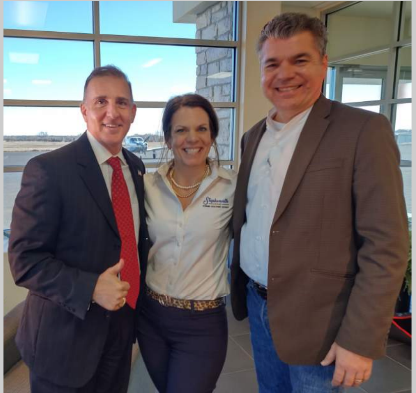
Pictured with Stephenville Economic Development Authority